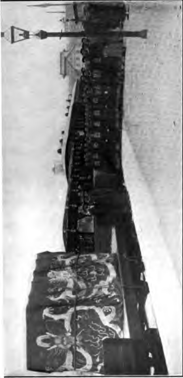
PORTRAIT OF THE EMPRESS DOWAGER BY MISS CARL, ABOUT TO LEAVE PEKING FOR ST. LOUIS EXPOSITION